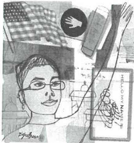
Donna Grethen / OP Art

The American people support it, the Democrats support it and it's time for Republicans to approach the immigration issue in an adult fashion and support this initiative, too.